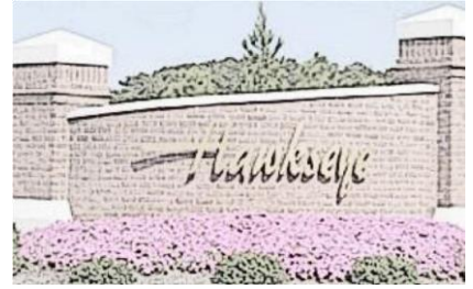
Hawkseye Property Owners Association