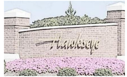
Hawkseye Property Owners Association