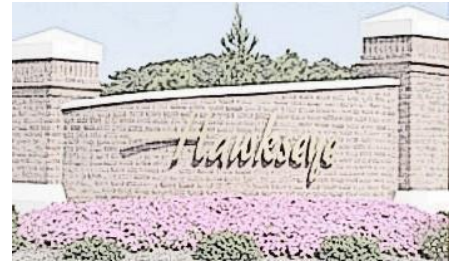
Hawkseye Property Owners Association