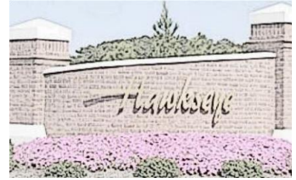
Hawkseye Property Owners Association