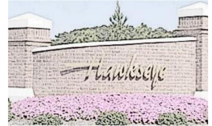
Hawkseye Property Owners Association