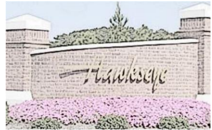
Hawkseye Property Owners Association

Note: This is a brief overview of the event sequence prior to construction. For more information, please refer to the Contractor and Property Owner(s) Responsibilities document.