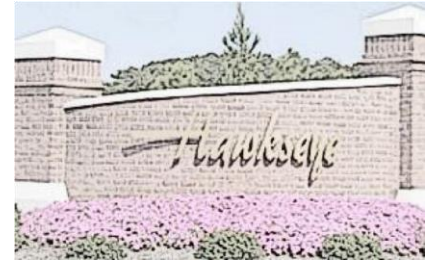
Hawkseye Property Owners Association