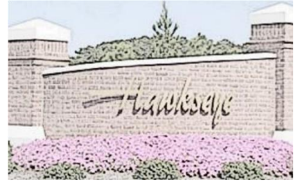
Hawkseye Property Owners Association